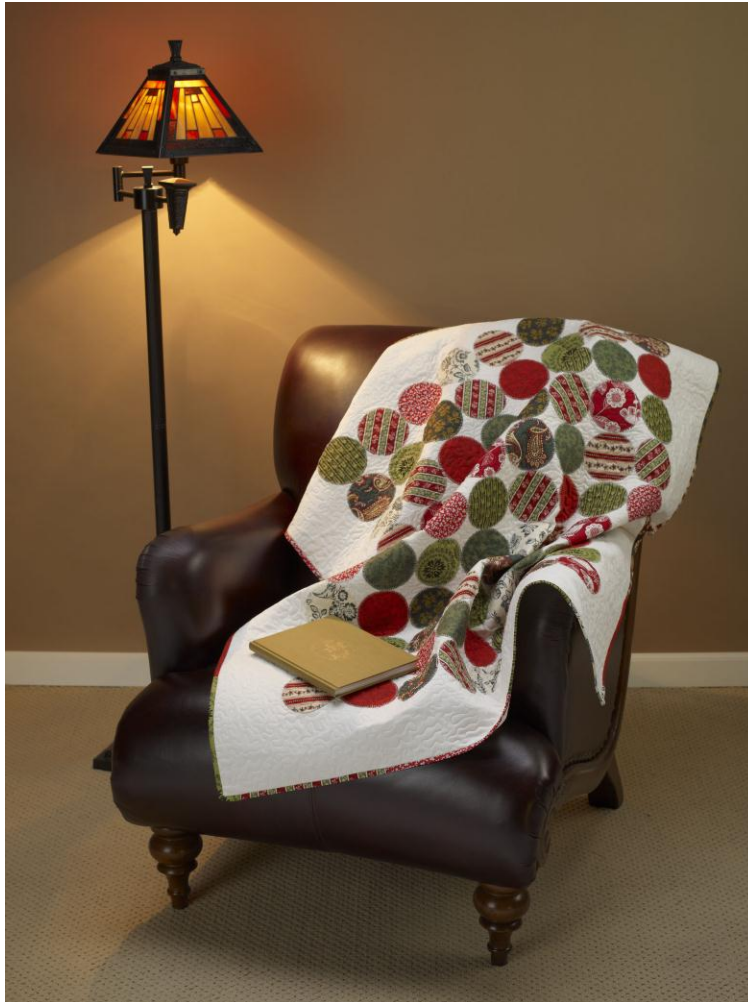
Approximate size 44” x 52”