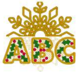
CT1: Christmas Designs